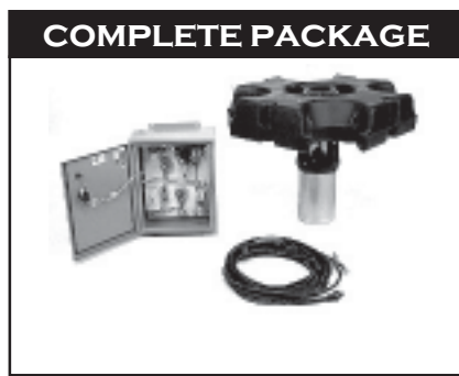
U.S. Package: Unit, NEMA 3R Power Panel (with timer, GFCI (except 460V), breaker, surge arrester, HOA switch and thermal overload protection), 50 ft. of SOOW cable. Int'l Package: Unit and 15m of cable (no cable on CE).